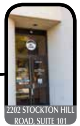
2. KRMC Family Practice Residency Clinic