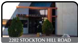
3. Patient Financial Services