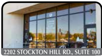
1. Sunshine Canyon Family Healthcare