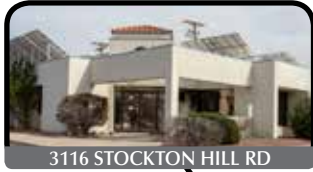
A. Post Hospital Care Clinic