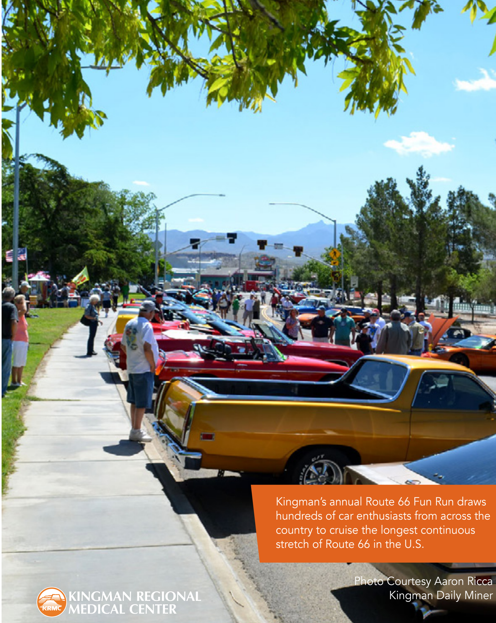
Kingman's annual Route 66 Fun Run draws hundreds of car enthusiasts from across the country to cruise the longest continuous stretch of Route 66 in the U.S.